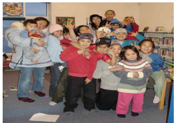
Posing for pictures