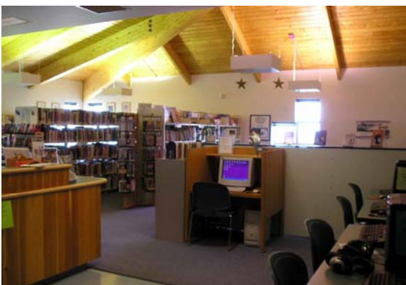
View of the library