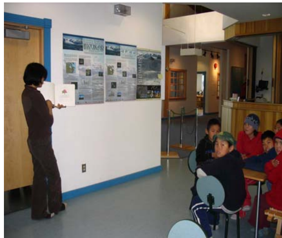
Inuktitut Storytime during TD Reading Club